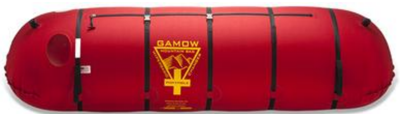
Figure: Gamow bag ( www.chinookmed.com )

Note: most of the mentioned medicine is available only on prescription. Therefore, please consult with experienced doctor before purchasing medicine!